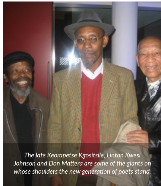
The late Keorapetse Kgositsile, Linton Kwesi Johnson and Don Mattera are some of the giants on whose shoulders the new generation of poets stand.

In his second term of office, which he won with an overwhelming two-thirds majority, Mbeki appointed another politician who is a known literary enthusiast and, at the time, leading intellectual in the ruling party, the African National Congress, Pallo Jordan whose parents A.C. Jordan and Phyllis Ntantala, were internationally acclaimed writers and academics in their own right. Jordan appointed an equally respected individual and well-known poet, Keorapetse Kgositsile, as his Special Advisor. Under Jordan, the Department of Arts and Culture supported the establishment of the National Poet Laureate Prize in 2005, the South African Literary Awards a year later, and reprinted the largely out-of-print classics in the nine constitutionally recognised indigenous languages.